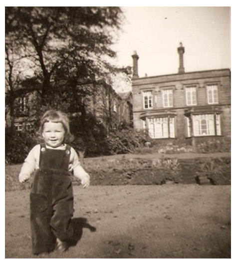
The author at Ashwood