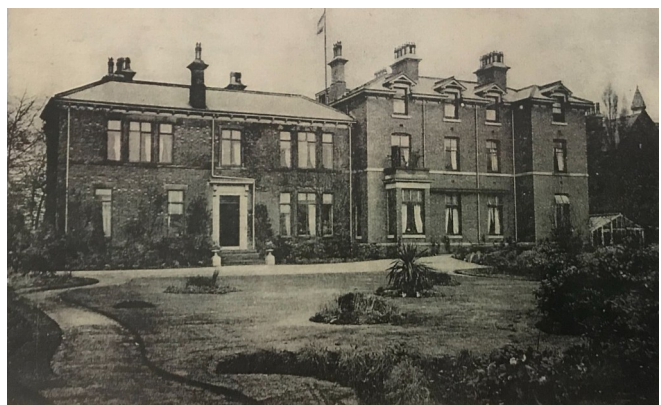
The Limes, Kirkstall Lane, c1905