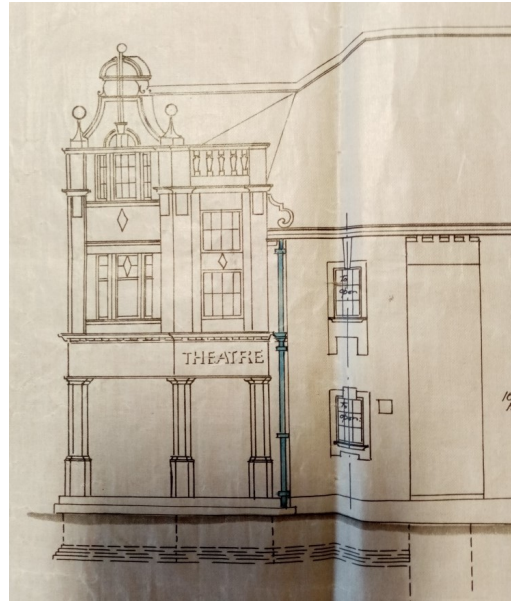
Elevations of the proposed Hyde Park Picture House, 29 April 1913