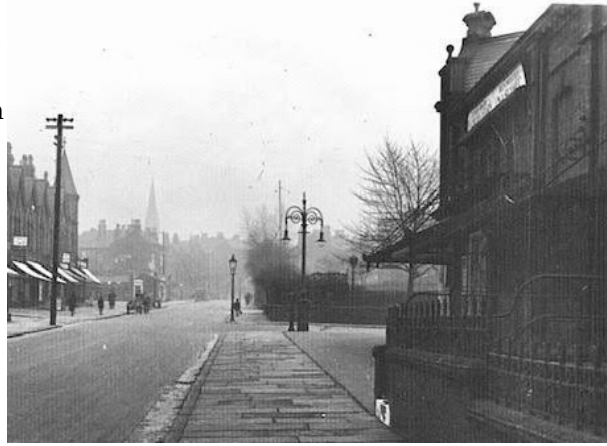
Hyde Park Picture House, Brudenell Road, 1935

In 1930 the Picture House was adapted for sound, for the newly-arrived ‘talkies’. There had been doubts whether this was just a flash in the pan, doomed to be forgotten, but in the end the Picture House had to move with the times, just as later it had to adapt to colour and other technological advances. The 30s also saw the first connection between the Picture House and the growing interest nationally and locally in independent and foreign film. The Leeds Film Institute Society , founded in 1937 with some 400 members, began in 1938 to use the Hyde Park for its public screenings of foreign and ‘Art’ films. Its post-war successor, the Leeds Film Society , moved its shows to the Headingley Picture House at Cottage Road, but this early connection of Hyde Park with independent and art cinema was to be revived very successfully later in the century.