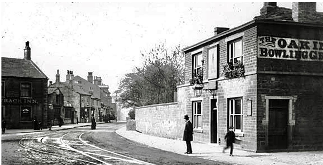
The Original Oak, undated