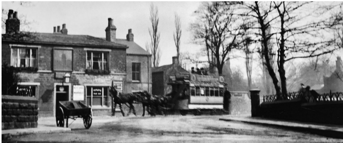
The Original Oak, c1890