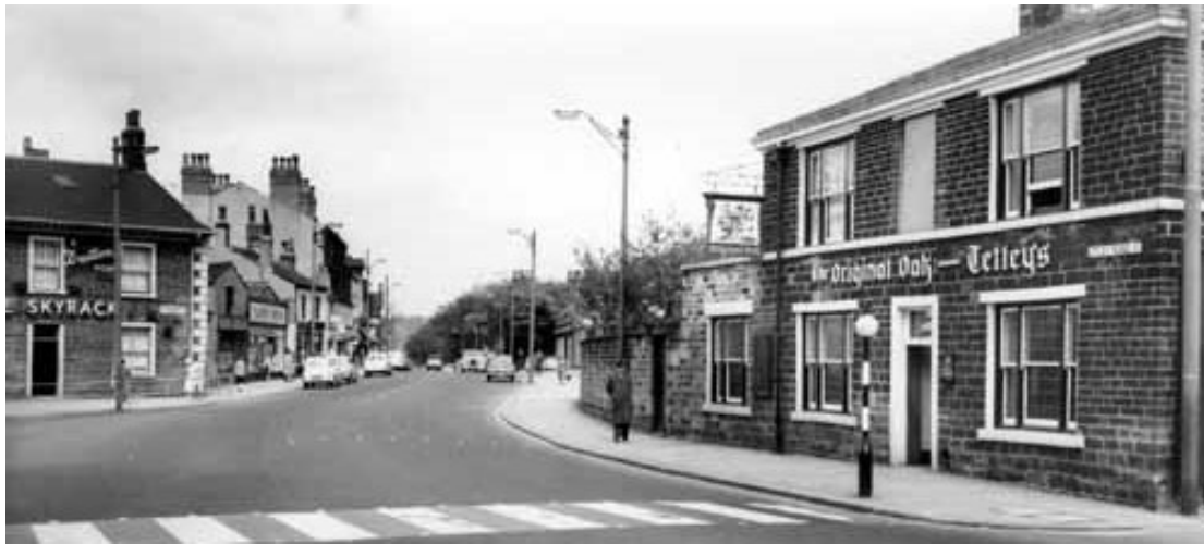
The Original Oak, 1960s

A menu from 1879 gives an idea of the range of food offered by the dining room, alongside an extensive wine list: