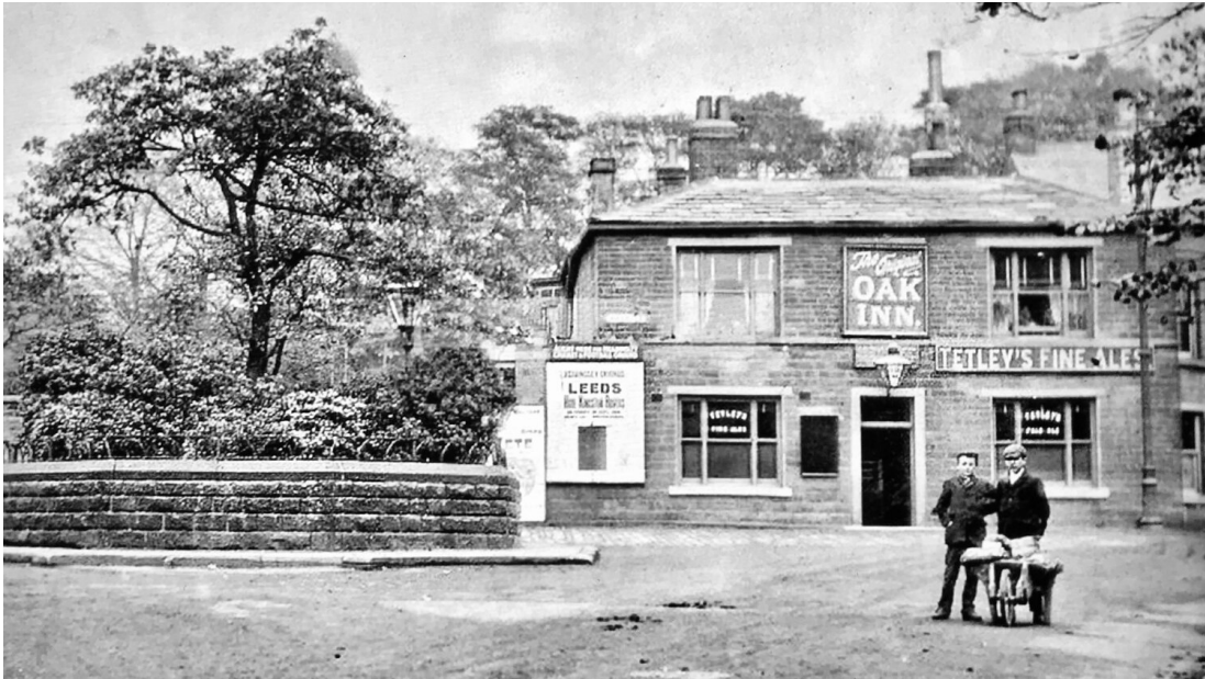
The Original Oak Inn, c1900