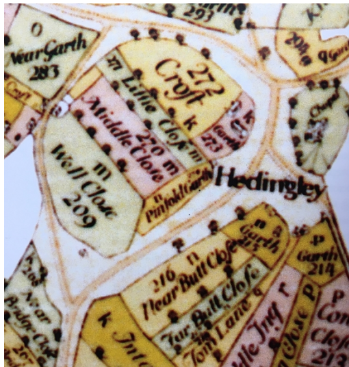
Cardigan Estate Map 1711