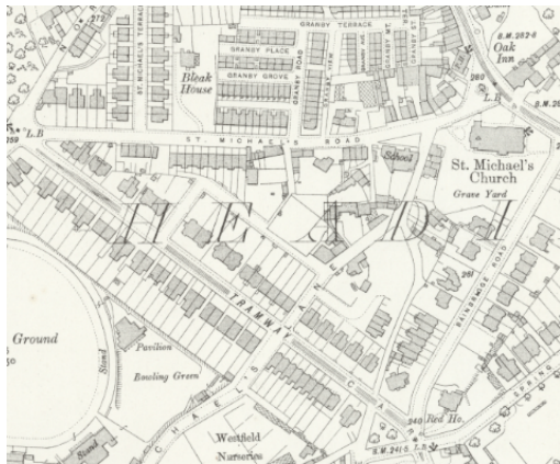
Ordnance Survey 1908