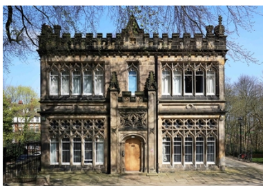
North Hill House