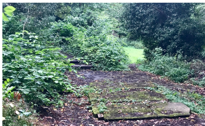
Site of the memorial today

Obituary , Yorkshire Post , 8 February 1907