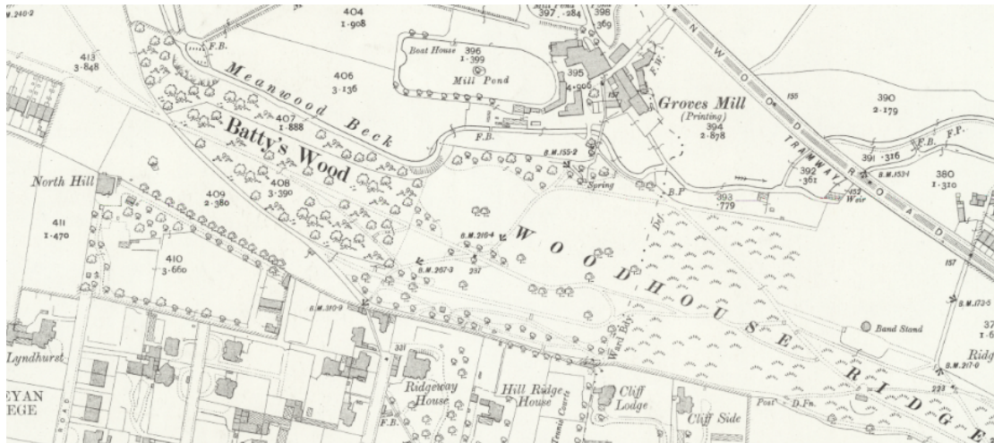
North Hill, Batty's Wood and Woodhouse Ridge, Ordnance Survey, 1908